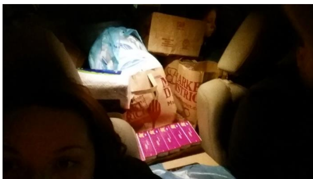
The drive home from Giant Eagle after picking up the groceries... please note the children are in the back seat.

These baskets were made possible with the assistance of Giant Eagle Marketplace in Upper Arlington at Kingsdale and by a substantial monetary donation from Everest Institute in Gahanna. Thanks to everyone who gave us a family name and helped build the baskets. Each year this project gets better and better. I can't wait to see what next year brings. (Photos on this and the back pages)