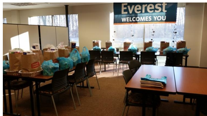
All 14 meals, packed and ready to go.