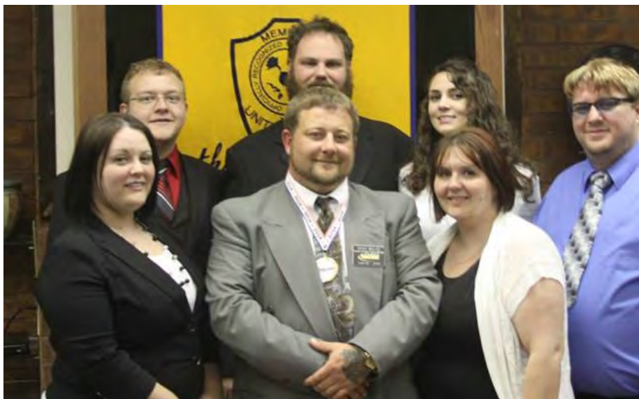
North Columbus Jaycees Board of Directors

Your 24 hour destination for donuts, coffee, gyros and more!