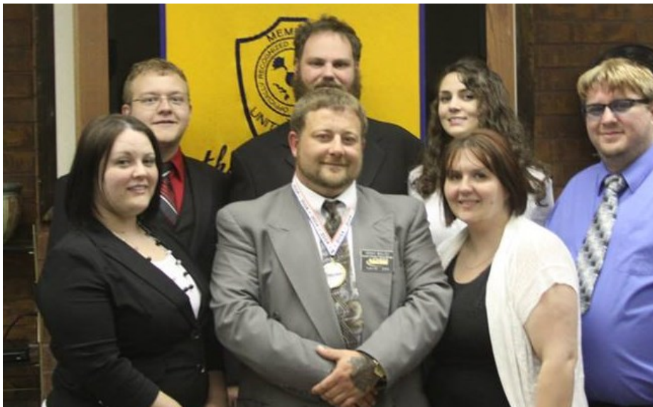
North Columbus Jaycees Board of Directors