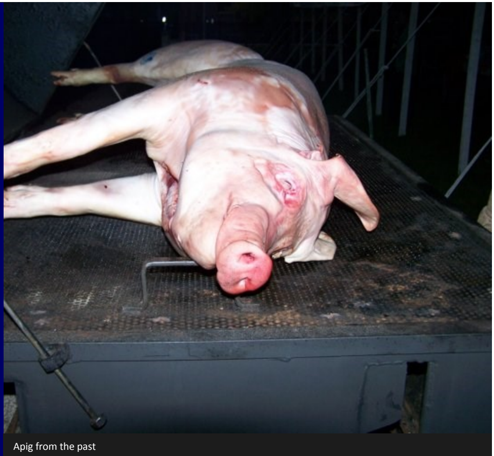
Apig from the past